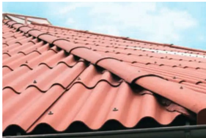
This photo is indicative of the shape and style of the roofing tile, NOT the color. The color selected is “Natural Gray”.

The roof tiles being used for this project are “Europa Underlay PST-200.5-0 Fiber Cement Corrugated Roofing” in the color of Natural Gray, and which are being produced by Landini SpA (Italy). These tiles were selected to maintain as similar an appearance to the existing tiles as possible. A sample is available to be seen in the MVCMA Office.